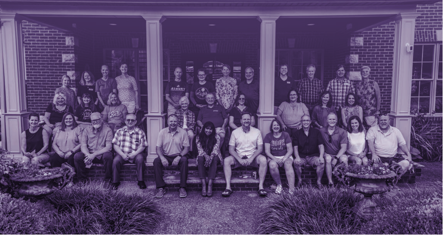
1987 Watchmen Class Photo from Reunion 2022.